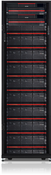
Figure 2 NST6530 with Nexsan E-Series SAS Storage Arrays in a 42U rack.