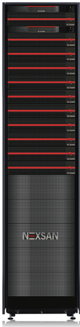
Figure 3 NST6530 with Nexsan NST224X SAS Storage Enclosures in a 42U rack.